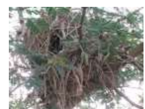
Nest of Lonchura punctulata