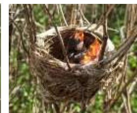
Nest of Chrysomma