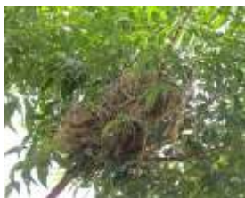
Nest of Passer montanus