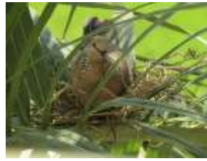
Streptopelia chinensis and its nest