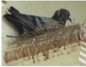
Columba livia and its nest