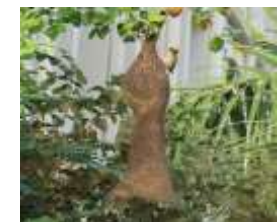
Ploceus phillipinus and its nest