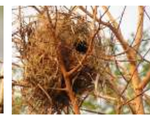
Nest of Passer flaveolus