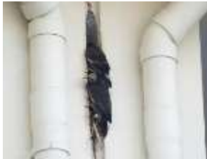
Acridotheres tristis and its nest