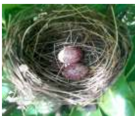
Nest of Pycnonotus