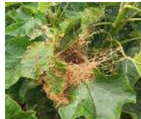
Nest of Prinia inornata