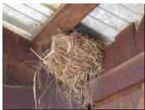
Nest of Passer domesticus