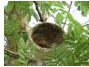
Nest of Aegithina tiphia