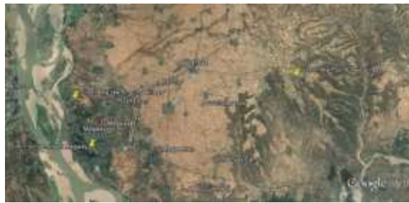
Figure 1 Location map of study area and study sites

Three study sites were allocated in Magway Township. These three study sites were (i) Magway University Campus (Site I), (ii) Wa-taw-chaung Village (Site II) and (iii) Kyit- Sone-Pwe village (Site III). (Fig.1)