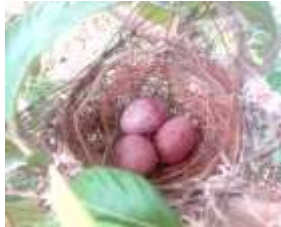
Nest of Pycnonotus blandfordi