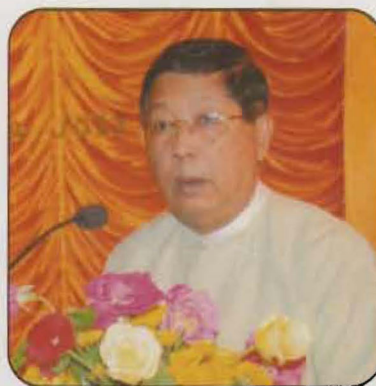
H. E. Dr Mya Aye, Union Minister for Education

The Myanmar Academy of Arts and Science, officially instituted on 16 th August 1999, has now entered its 15 th year. Over the years it has made sustained efforts to realize its principal objectives of encouraging and promoting research and academic excellence in Myanmar higher institutes of education towards building a modern and democratic nation that has earned a rightful place in the global community. The Myanmar Academy of Arts and Science has, to a considerable extent succeeded in disseminating knowledge and upgrading the standard of scholarship appropriate to a knowledge-based society, though it realizes that much still needs to be done. It