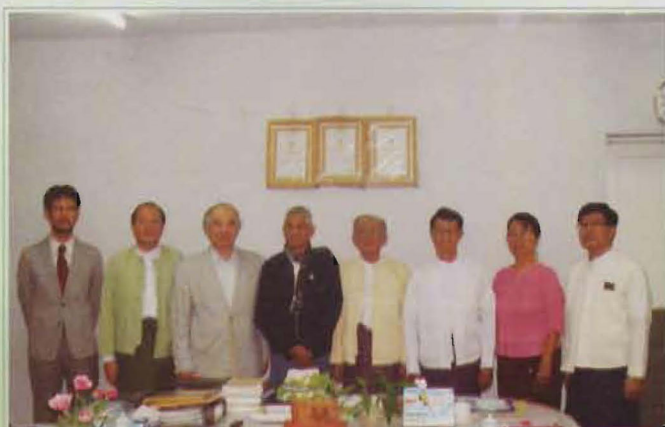
Members of the Science Council of Japan and the Japan International Cooperation Agency (JICA)