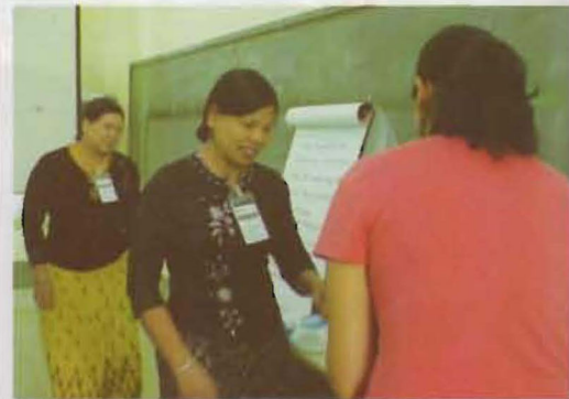
Participants at work