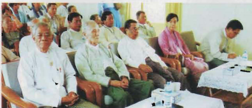
Audience at Best Paper Award Ceremony