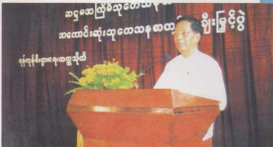
Minister's Speech at Best Paper Award Ceremony of Research Conference