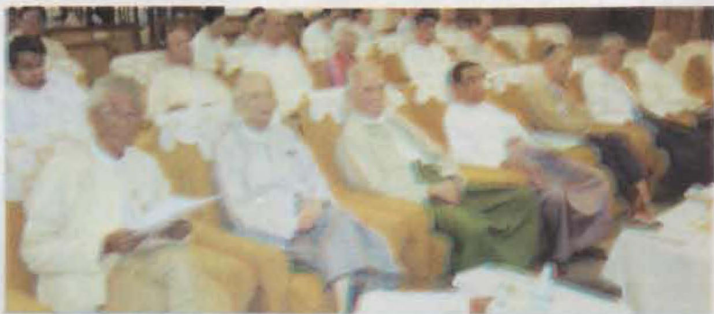
Audience at Opening Ceremony