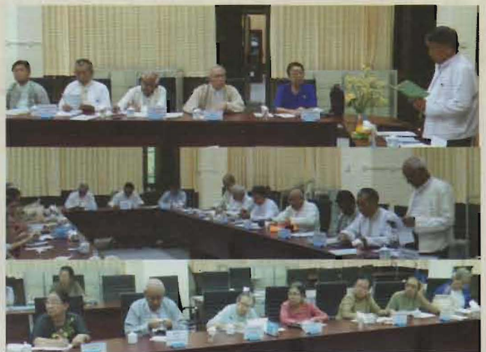
Monthly regular meeting held usually on the first Wednesday of the month. This meeting was attended by the full complement of EC members