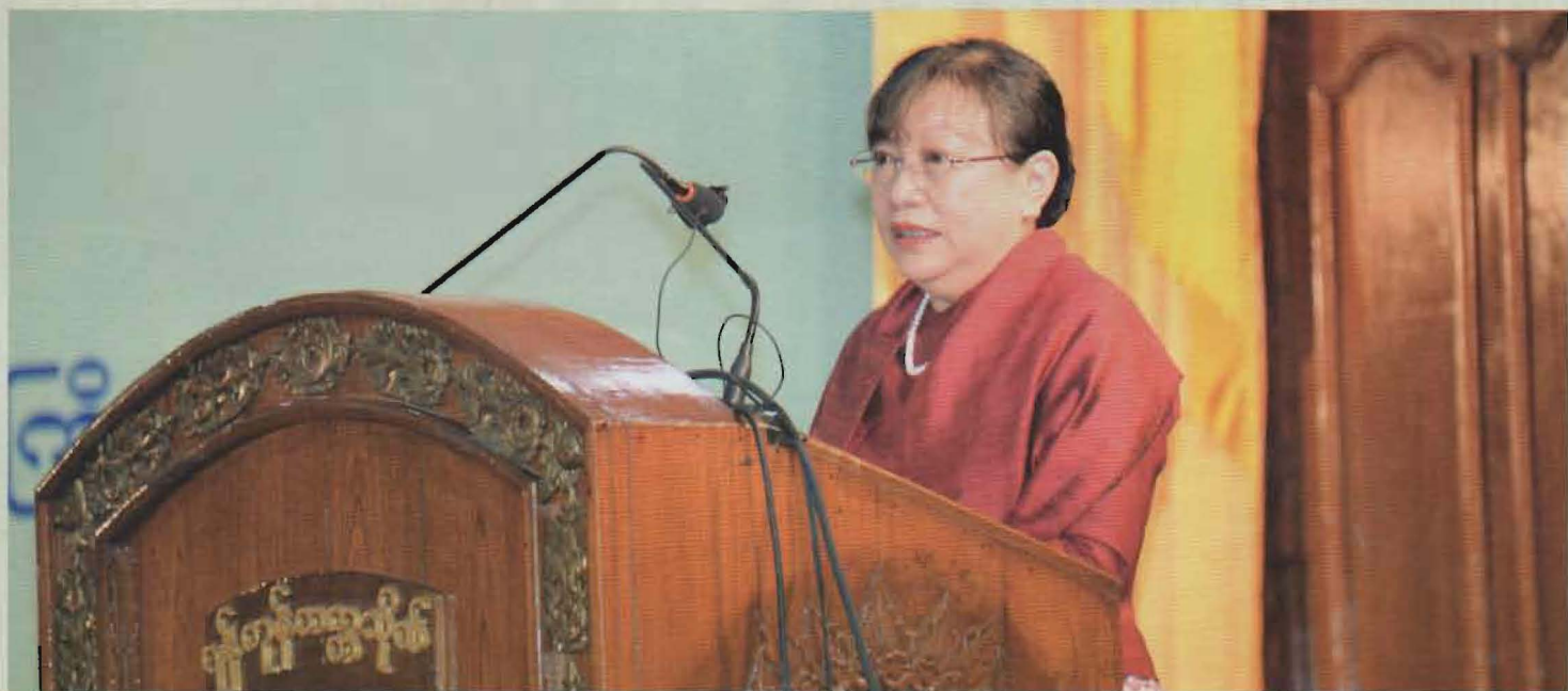
Union Minister of Education Dr. Daw Khin San Yee