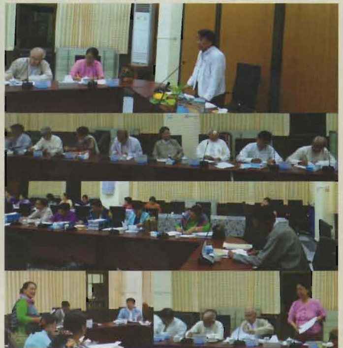
EC-members at a meeting with professors and heads of department to discuss criteria for selection of Best PhD dissertation and research report